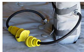
JUMPER & PLUGS