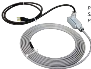
POWER LEADS AND SENSORS ARE PREWIRED.

Traced Heating Blankets and Jackets are a great solution where instruments or other components need to be serviced. Traced Jackets may quickly be removed and replaced for temporary access. Large areas may be engineered using a modular approach having multiple heaters. Contact Southeast Thermal Systems for fast, professional design assistance.