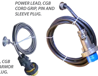
RTD SENSOR, CGB CORD GRIP, ARMOR MULTI-PIN PLUG.