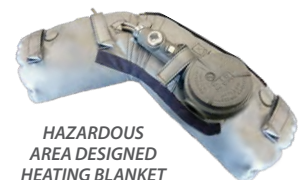
HAZARDOUS AREA DESIGNED HEATING BLANKET