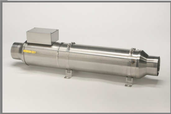
Shown with optional inlet & exhaust fittings