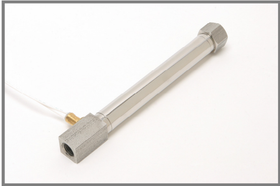
Shown with optional inlet & exhaust fittings