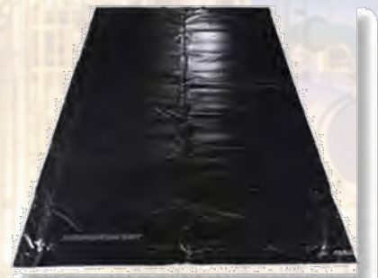
FLAT BLANKET SPEC SHEET