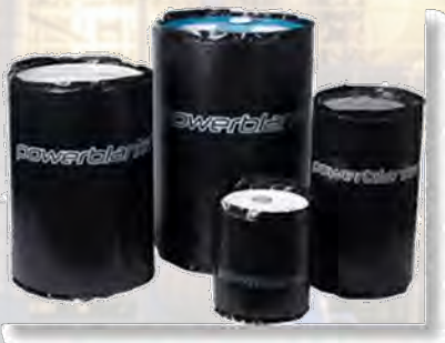
DRUM & BUCKET HEATERS SPEC SHEET