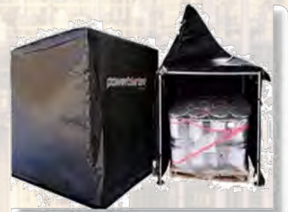
HOT BOX HEATER SPEC SHEET