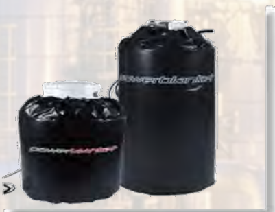
GAS CYLINDER SPEC SHEET