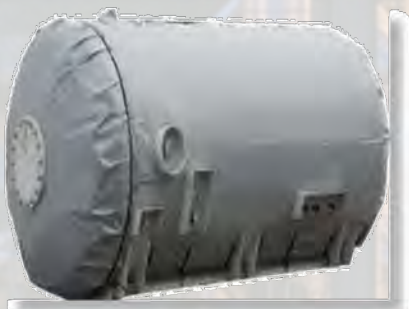
CUSTOM TANK HEATER SPEC SHEET