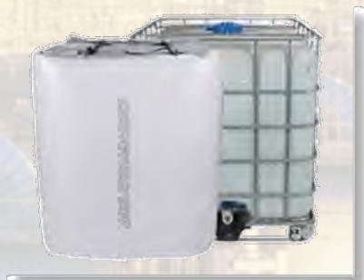
TOTE BLANKET SPEC SHEET